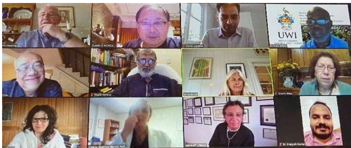
Photo: Virtual WONCA executive meeting

Greetings again from the Secretariat. A mixed bunch from me this month, with a number of issues and topics to highlight.